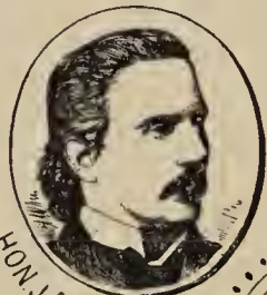
HON. J.A. CHAPLEAU.